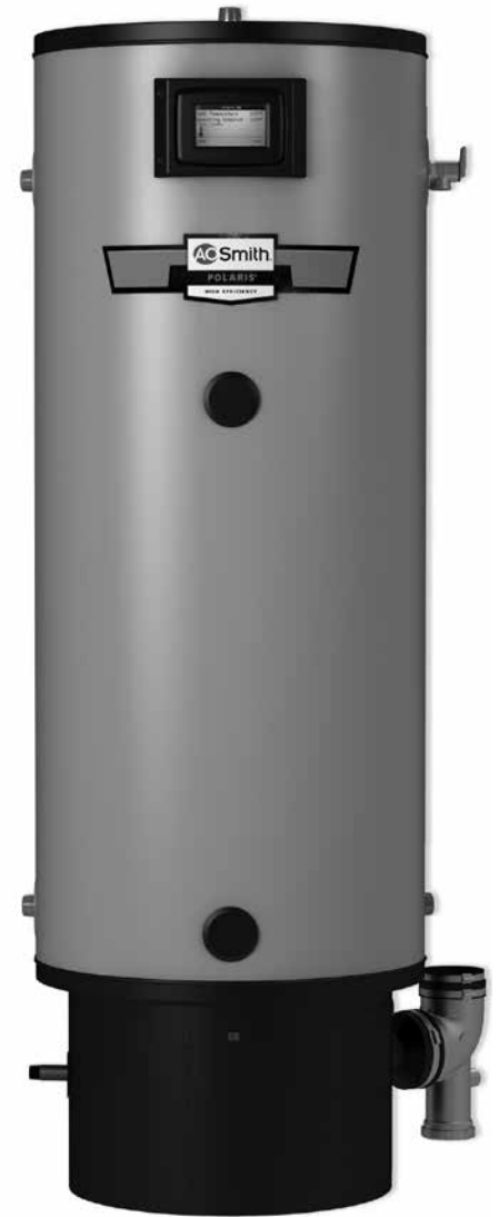
MODEL SHOWN GTP-199 SERIES 200/201

*When sized appropriately. Model GTP 199 can deliver 6.95 GPM continuous flow, based on 65°F inlet water temperature, 120°F outlet temperature.