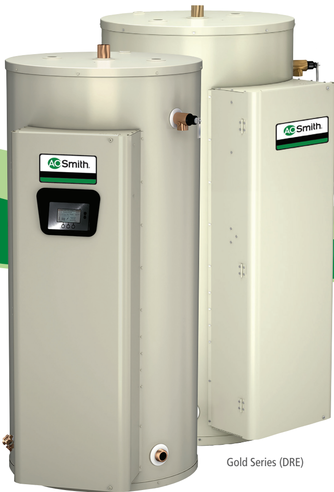
Gold Xi Series (DVE)