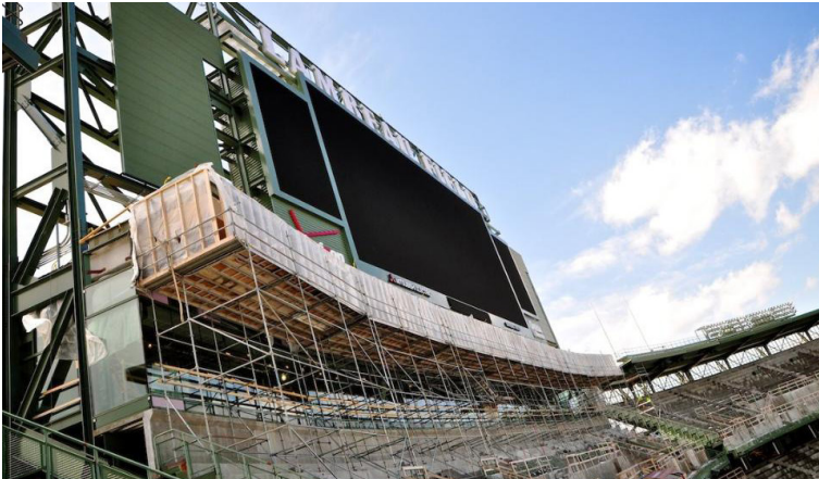
South End Zone Construction

Nearly 80,000 fans will be filing through Lambeau Field during each home game of the Green Bay Packers' 2013 football season—7,000 more than last season—thanks to the newly expanded south end zone. During the expansion of the Packers stadium, which broke ground in January 2012, 21 new water heaters were installed, bringing the total number of water heaters in the well-known stadium to 132. Construction took place year-round, stopping only on Saturdays and Sundays during the football season. The expansion makes Lambeau Field one of the largest stadiums in the NFL.