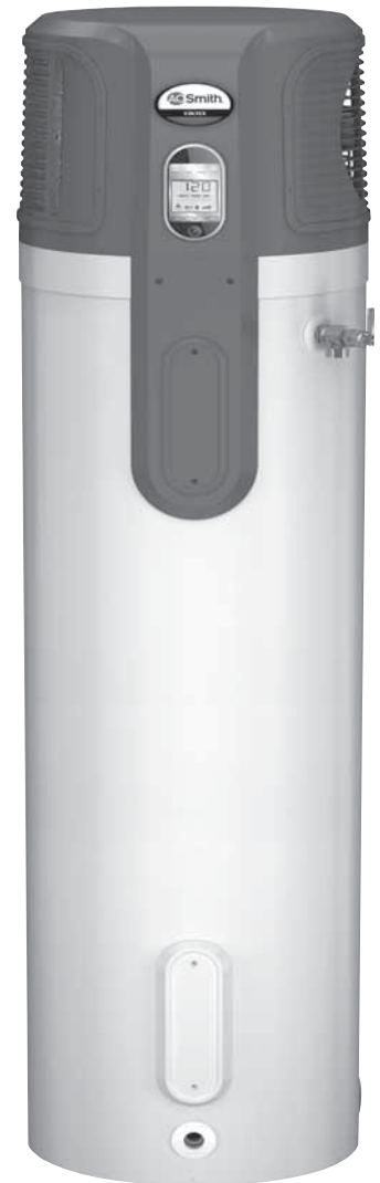
MODEL SHOWN PHPT-80